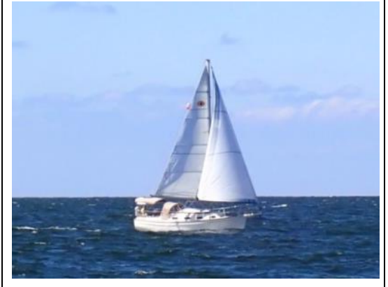
KNOT TOO FAST