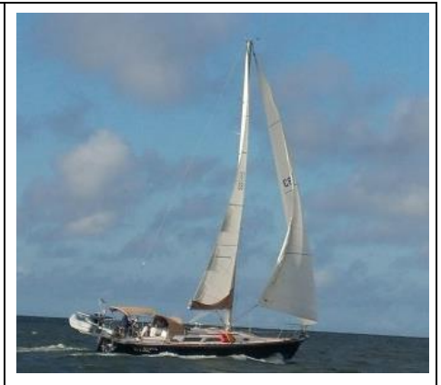
OUT OF THE BLUE