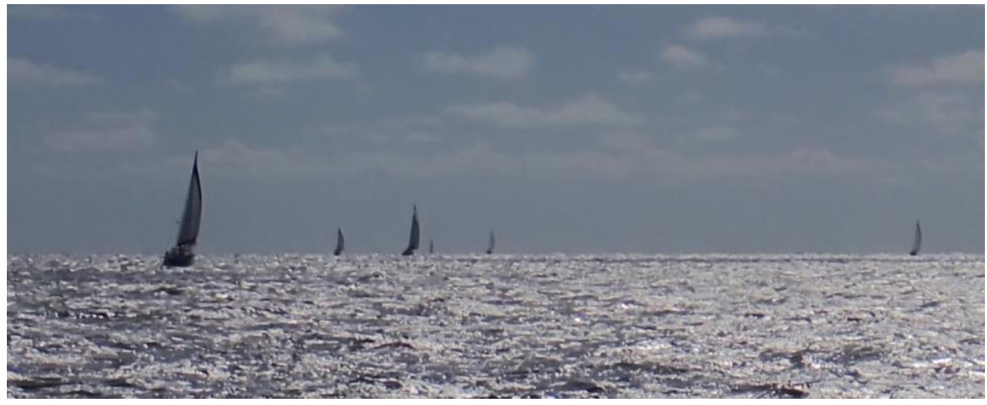
SCOO fleet homeward bound.