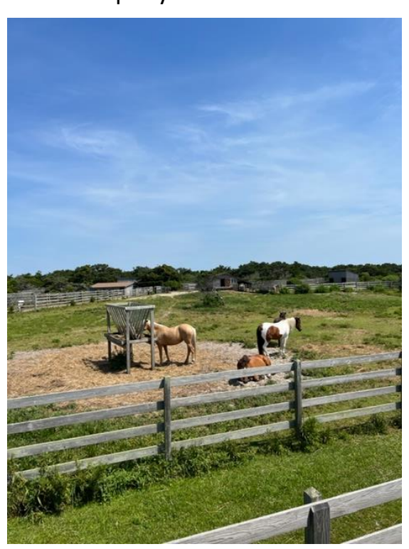
Before heading back, they visited the wild pony coral.

Some of the riders ventured back via the beach on their beach bikes.