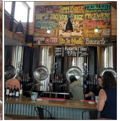
Today's brew selection