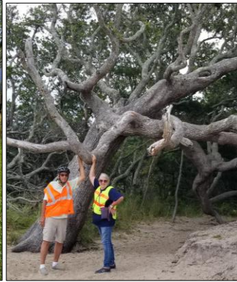
Sites along the Preserve Trail