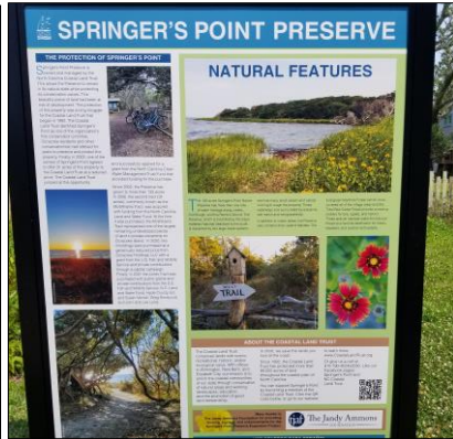
Springer's Point Preserve Bike/Hike