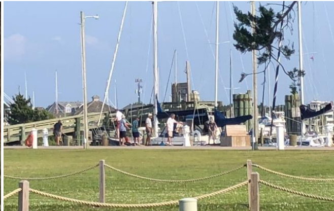
Helping hands make for a smooth docking.