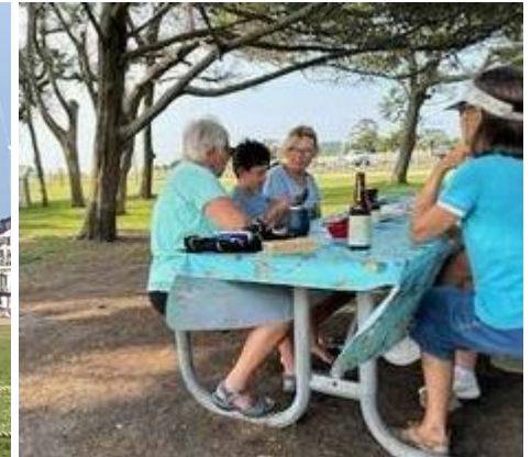
Catch Phrase for all ages