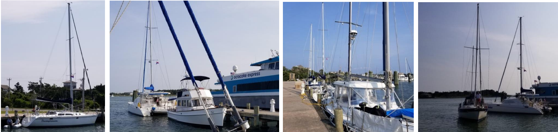
The National Park Docks held most of our SCOO boats