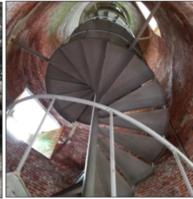
200 year celebration of Ocracoke Light House