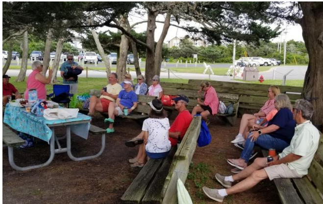
Let the fun begin.