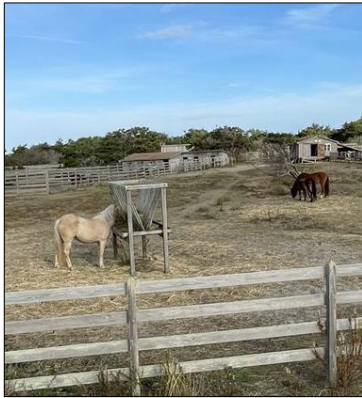
Ocracoke Pony Pen

Tuesday morning offered up rain to challenge us but we weren't deterred. Those long distance cyclers were stomping at the pedals to get going. By 9:45am the skies were clear enough for both the pony pen seekers and the village cyclers to peddle away. Those who chose to save their butts set out on different activities that concluded with the Noon time gathering of all at the 1718 Brewing Ocracoke for a brew and lunch from the Plum Point Kitchen. The rain held off and allowed us to gather at the National Park grounds for our heavy hors d'oeuvre meal followed by a trek to the local ice cream shop.